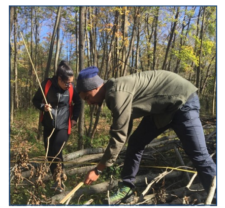
Allegheny students at Moxie Woods.